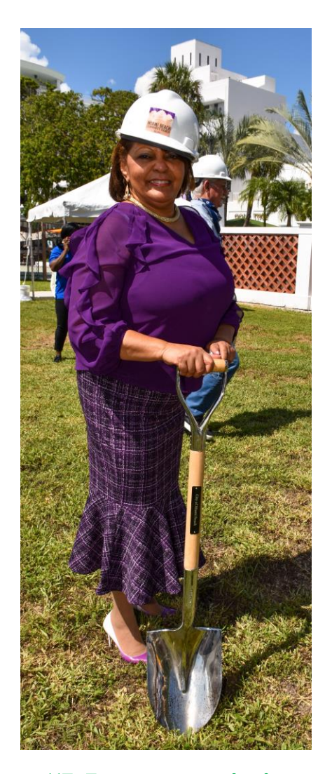
"Moreover it is required in stewards that one be found faithful."