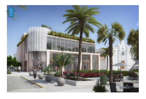
(Artist rendering picture of the building, facing south on Lincoln Road and Drexel Avenue.)

Construction has started on the 15,000 sq. ft. building designed by Touzet Studio.